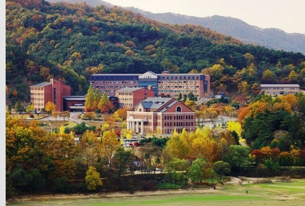
Wonju Campus (Gangwon Province)