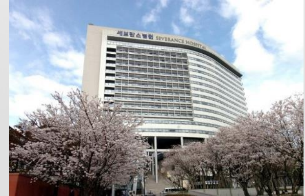
Yonsei University Health System (Seoul)