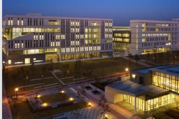
International Campus (Songdo Int'l City, Incheon)