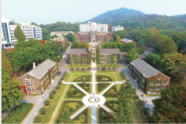
Sinchon Campus (Seoul)